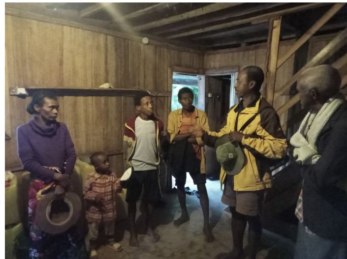
The three men in the middle are the fathers of Boto, Bosila and mainty.